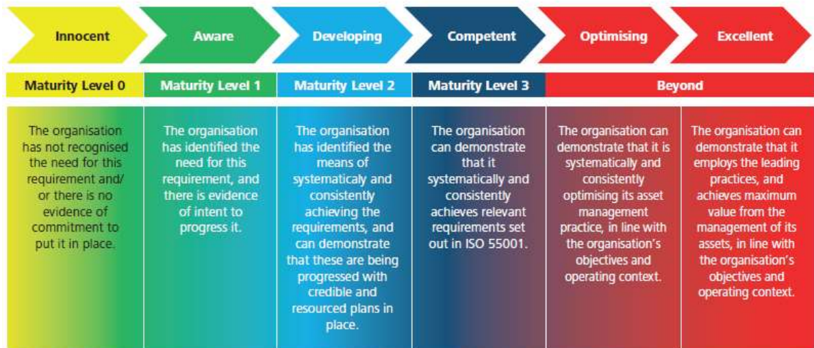
Figure 2 ISO 55001 Maturity Scale