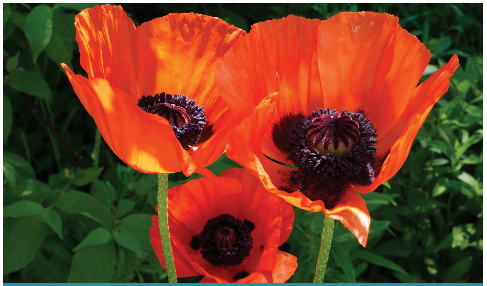
FIRES, BANS & BURNING