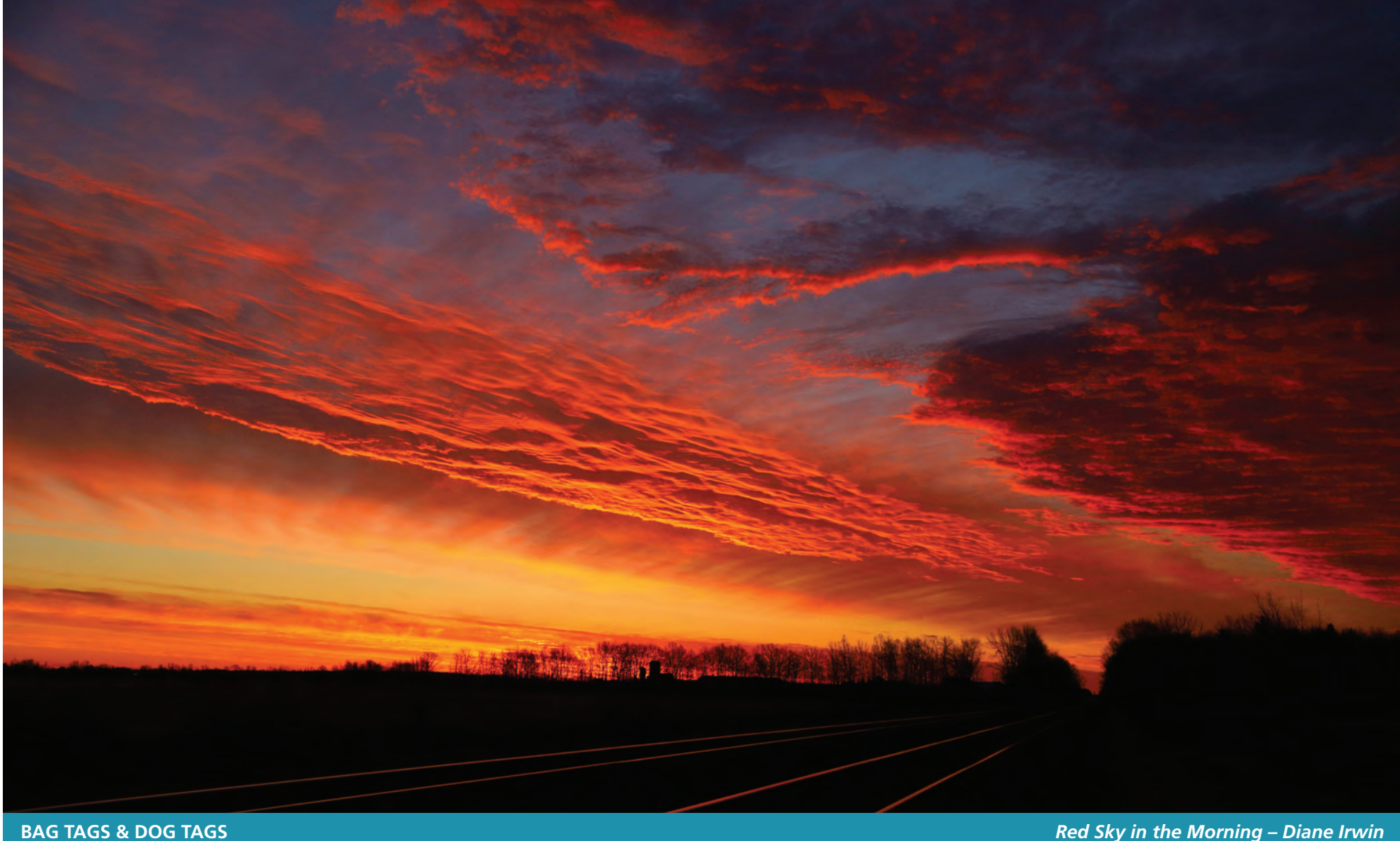
BAG TAGS & DOG TAGS