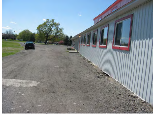
Gravel and grass parking area Accessible parking not marked