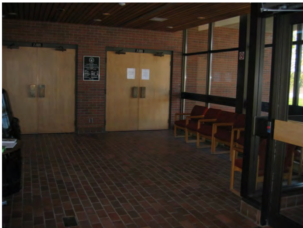
Front Foyer Location for touch screen and Pakflatt voting screens (vote tabulators may also be located here)