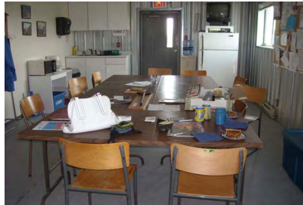
Meeting Room – tables to be re-arranged Several outlets available