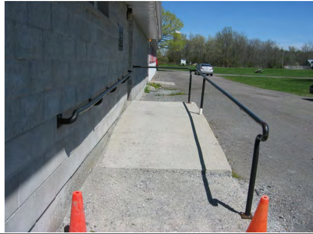
Accessible Ramp (currently under repair)