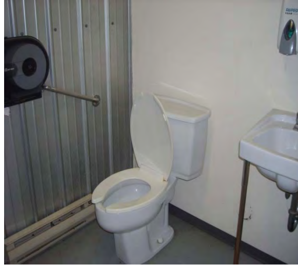
Washroom available for staff and voters Not accessible washroom