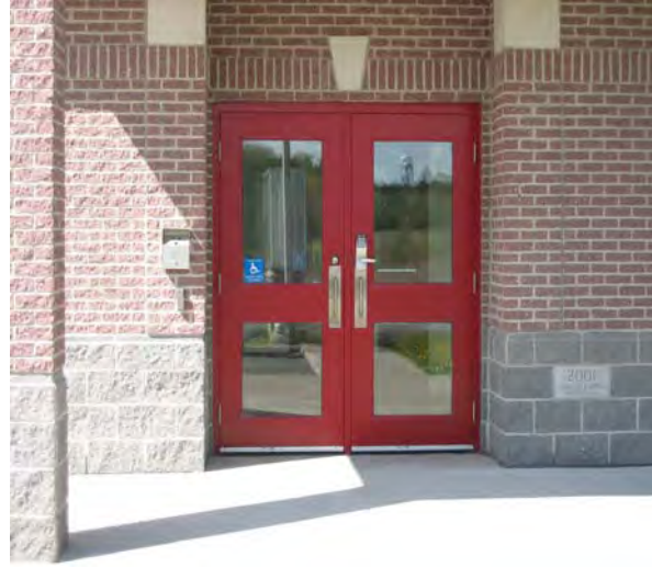
Automatic push button Accessible door