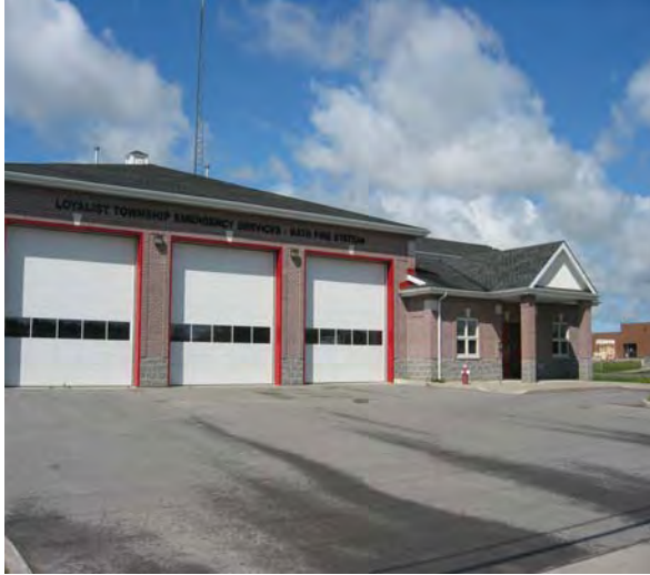
Bath Fire Hall - front entrance Adequate parking at rear