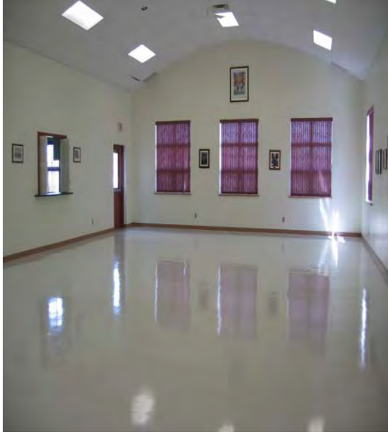
Meeting area - Large and spacious Emergency exit within meeting area