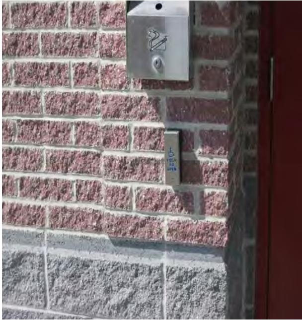
Accessible ramp to front entranceway