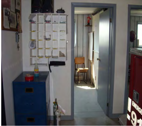
Entrance door to meeting room will not accommodate a wheelchair Voters with disabilities may have to be accommodated outside in bay