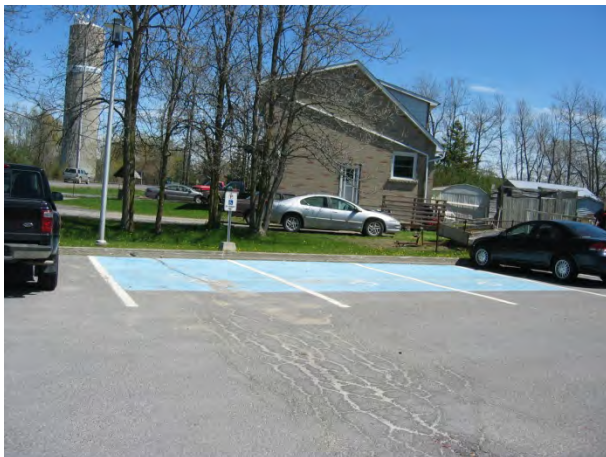
3 Accessible Parking Spaces – upright sign and pavement marking