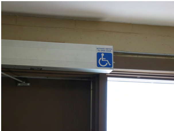
Automatic Door – must be turned on Swings out