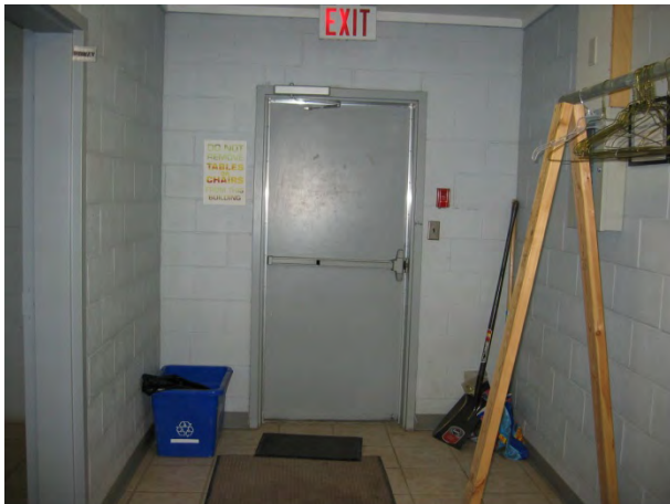
Entranceway – coat rack and matting and other Clutter to be removed (fairly spacious entryway)