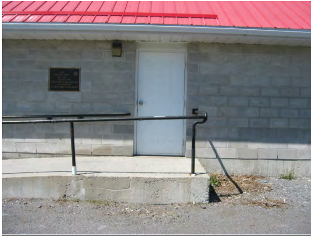
Entranceway to Meeting Room (One entrance to be used by everyone)