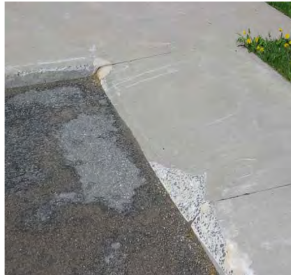
Mountable Curb deteriorating, to be repaired