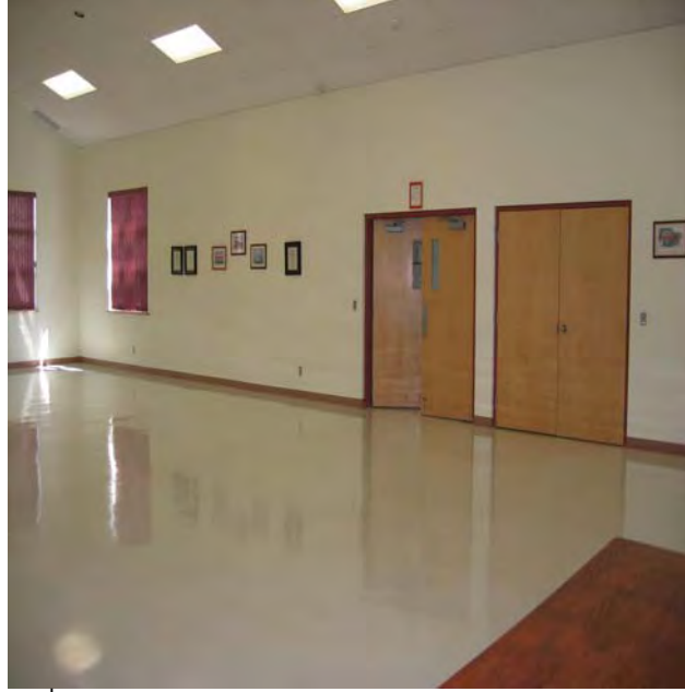
2 nd set of entry doors into meeting room To remain open during voting hours