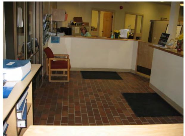
Office reception Area – location for computer and possibly a vote tabulator