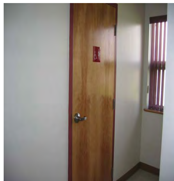
Male and female accessible washrooms In foyer