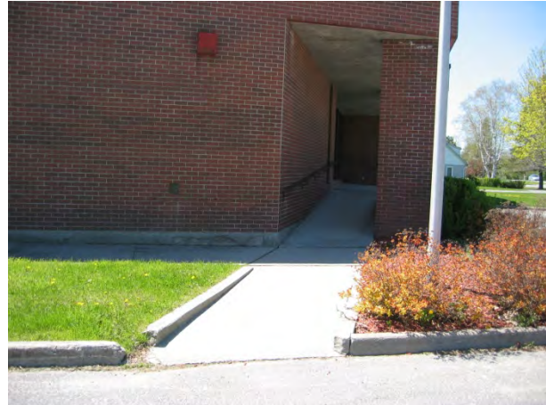
Accessibility Ramp from parking lot