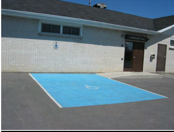
1 Accessible Parking Space – Upright sign Mounted on the wall, pavement marking