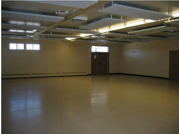
Large area for voting stations