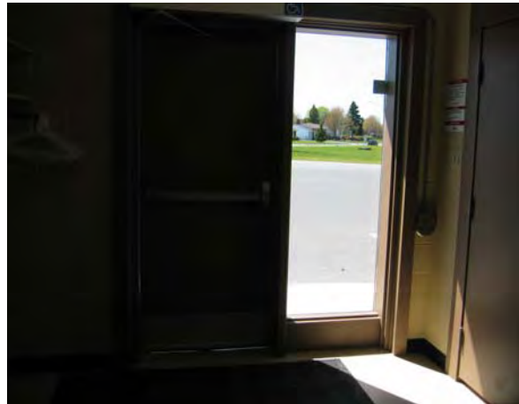
Vestibule and coat room – fairly large area