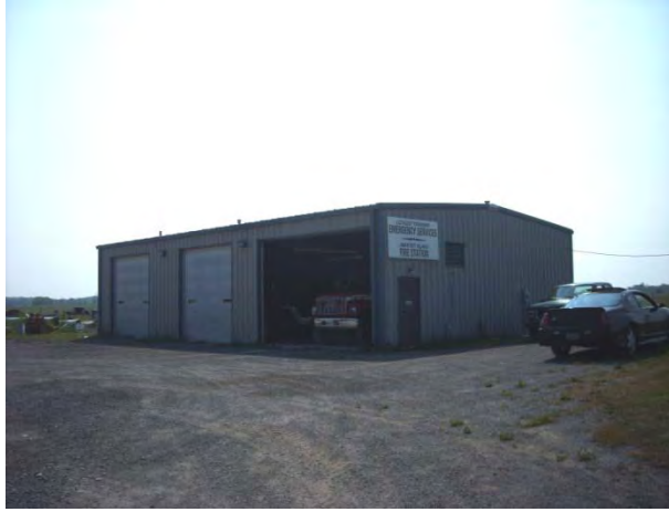
Amherst Island Fire Hall – front view Adequate Parking Requires Accessible Parking Sign