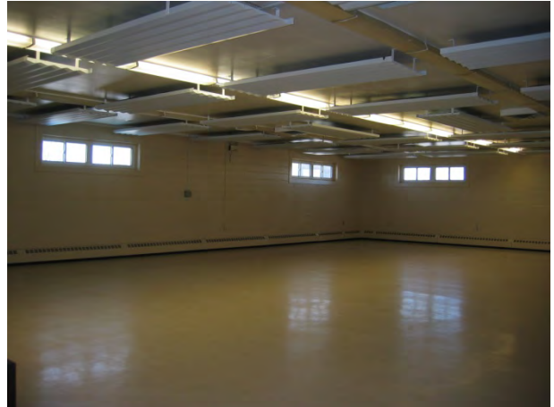
2 nd view of voting area