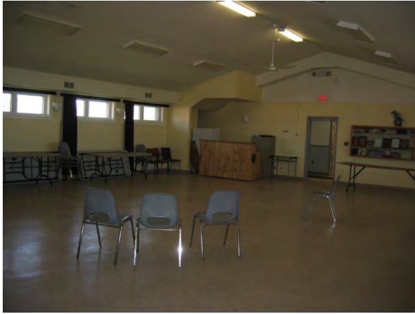
Voting Area – very spacious, many outlets, Emergency exit (1 of 4) Good Lighting