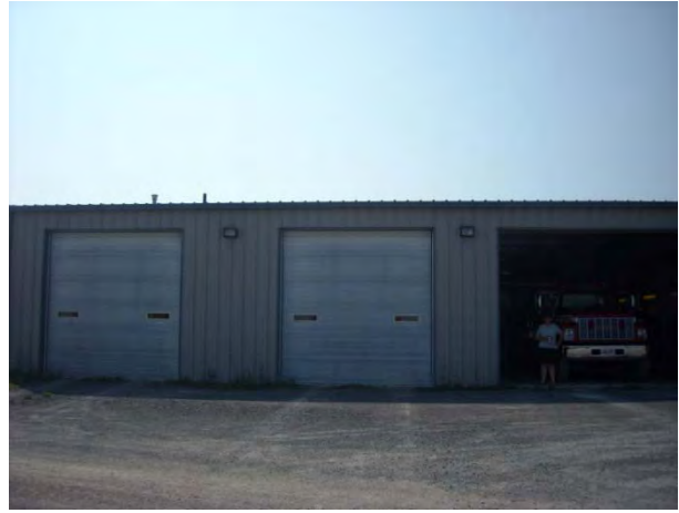
3 Bays - Centre Bay door to be open on voting days Fire Truck in centre bay to be removed