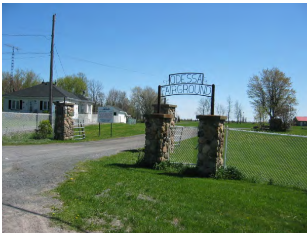
Entrance off Main Street, Odessa (not well marked) Entranceway off County Road 6 not identified by signage