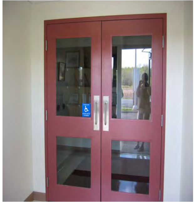
Automatic, accessible interior doors Spacious foyer