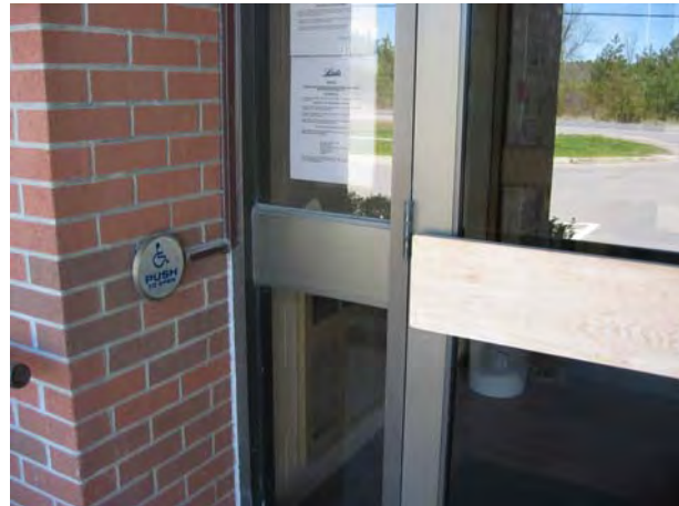
Automatic push button door (outside door)