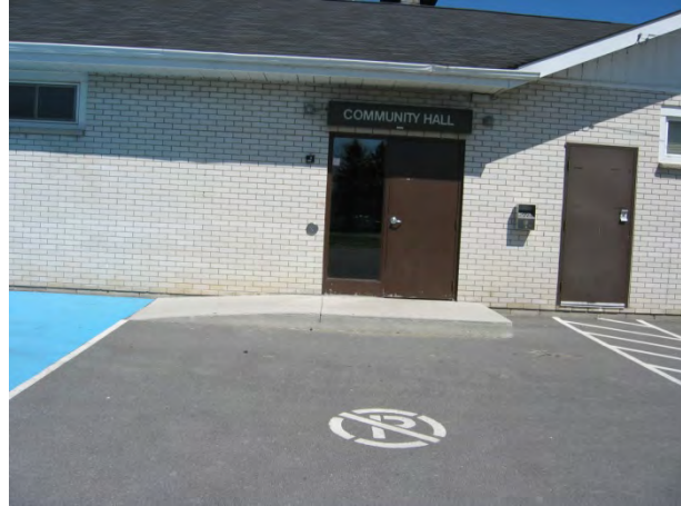
Entranceway with Accessibility Ramp