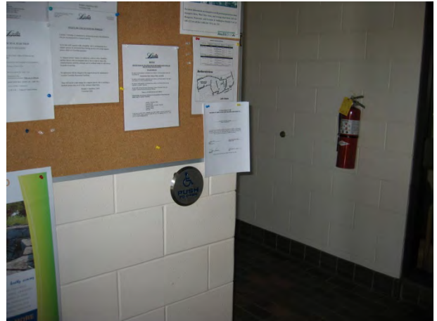
Automatic doors – push button