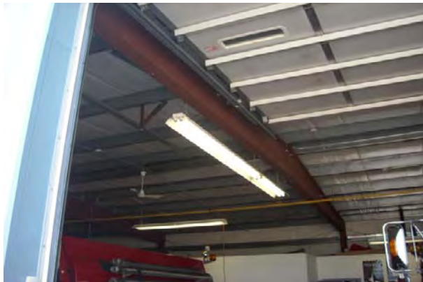
Overhead fluorescent lighting in bays Access route to meeting room