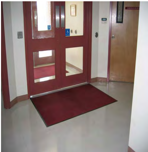
Automatic accessible doors (foyer view) Mats may have to be removed