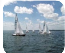
Lake Ontario, a sailor's dream