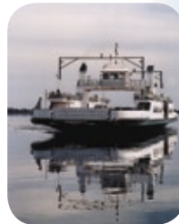
Amherst Island Ferry