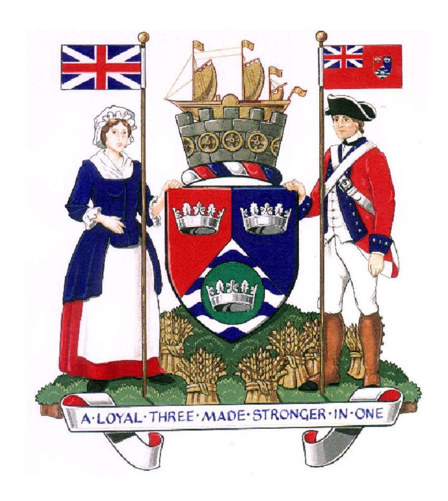
Emergency Response Plan 2019