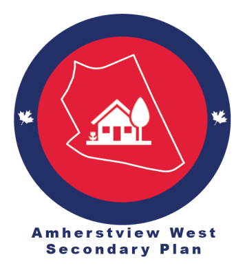
Figure 2: Project Logo Option